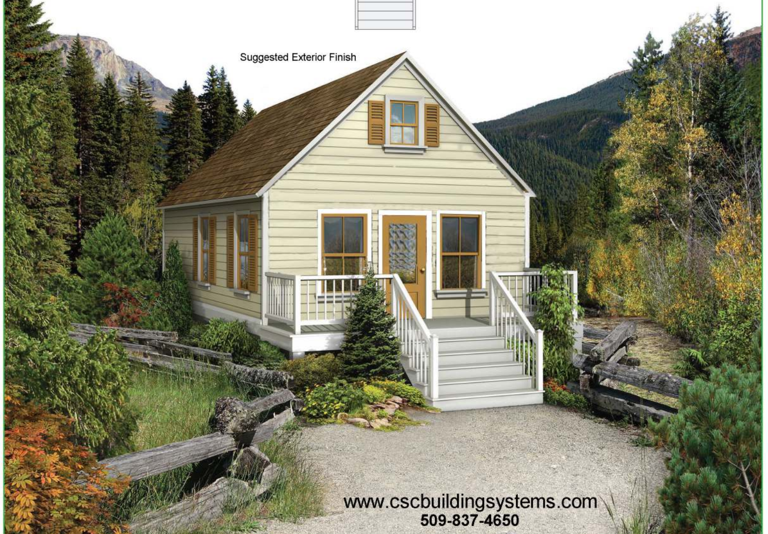
Suggested Exterior Finish