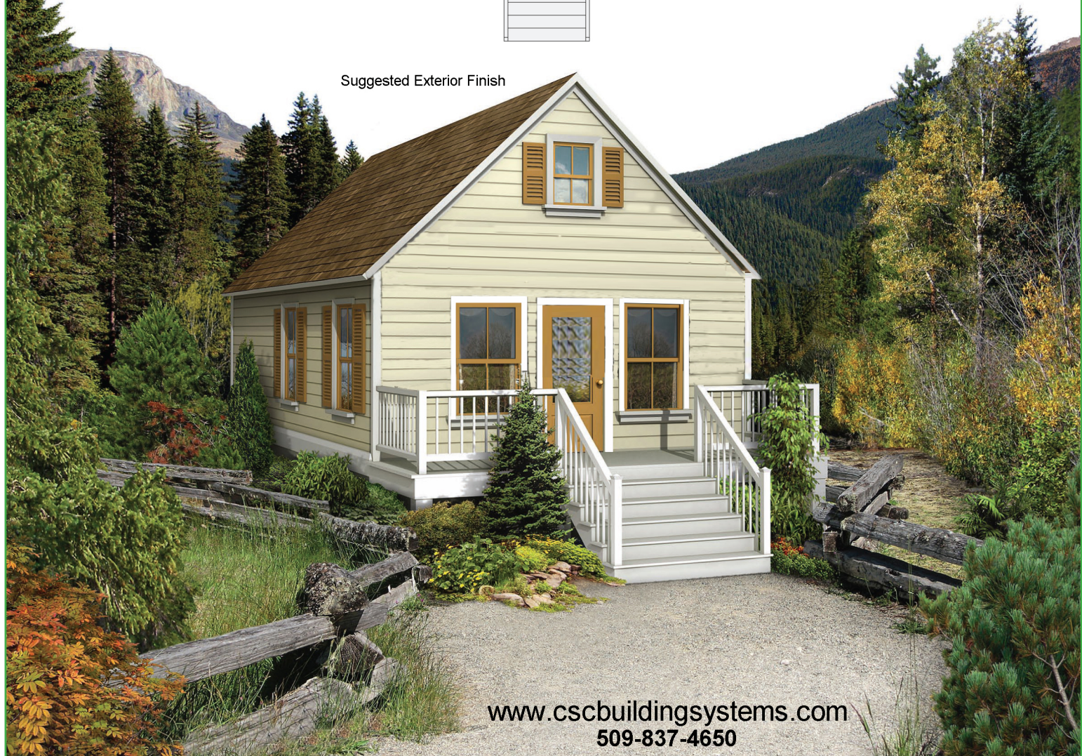
Suggested Exterior Finish